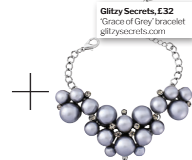
Glitzy Secrets, £32 'Grace of Grey' bracelet glitzysecrets.com