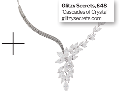
Glitzy Secrets, £48 'Cascades of Crystal' glitzysecrets.com