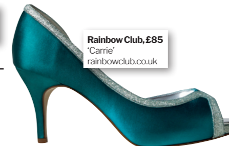
Rainbow Club, £85 'Carrie' rainbowclub.co.uk