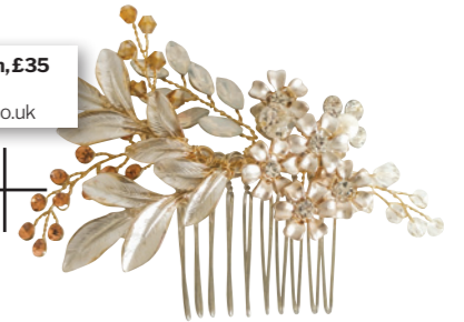
The Bobby Pin, £35 'Amber Comb' thebobbypin.co.uk