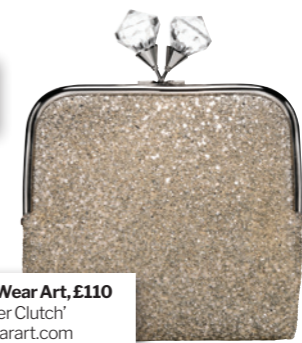
Love Art Wear Art, £110 'Nina Glitter Clutch' loveartwearart.com