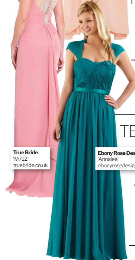
True Bride 'M712' truebride.co.uk