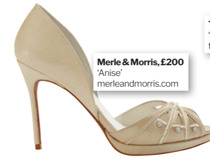
Merle & Morris, £200 'Anise' merleandmorris.com