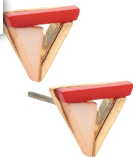
Oliver Bonas, £9.50 'Florin Triangle' earrings oliverbonas.com