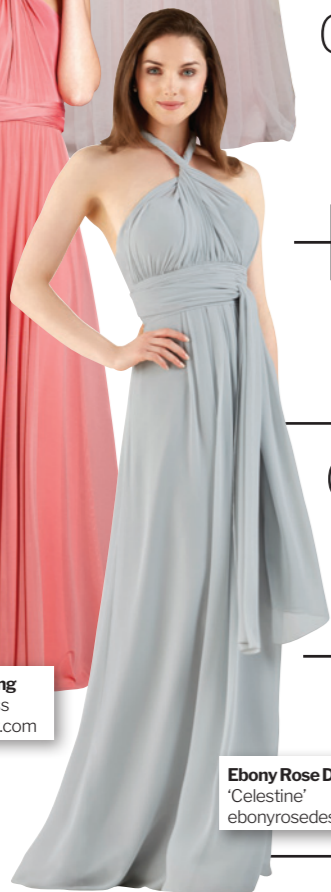
Ebony Rose Designs 'Celestine' ebonyrosedesigns.co.uk