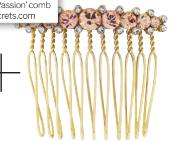
Glitzy Secrets, £23 'Peach Passion' comb glitzysecrets.com