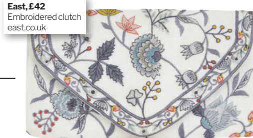
East, £42 Embroidered clutch east.co.uk