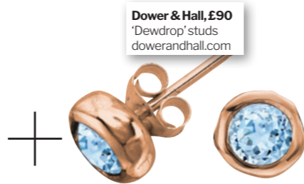
Dower & Hall, £90 'Dewdrop' studs dowerandhall.com