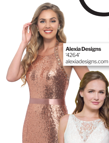
Alexia Designs '4264' alexiadesigns.com