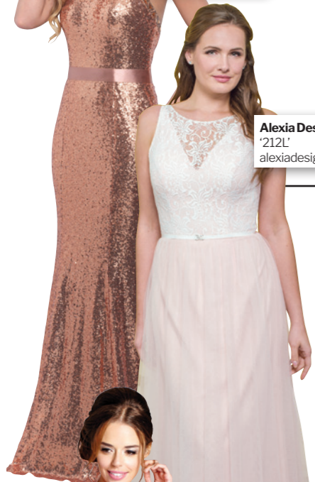
Alexia Designs '212L' alexiadesigns.com