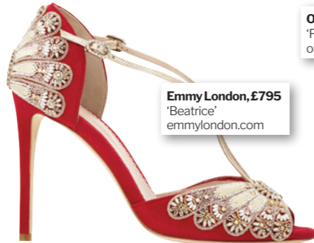
Emmy London, £795 'Beatrice' emmylondon.com