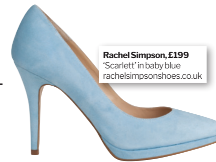
Rachel Simpson, £199 'Scarlett' in baby blue rachelsimpsonshoes.co.uk