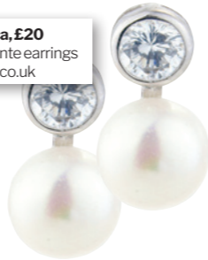
Bish Bosh Becca, £20 Pearl and diamante earrings bishboshbecca.co.uk