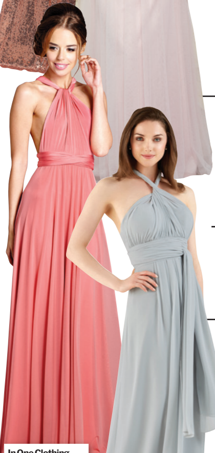
In One Clothing Multiway dress inoneclothing.com