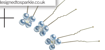
Designed To Sparkle 'Something Blue Flower Pins' designedtosparkle.co.uk