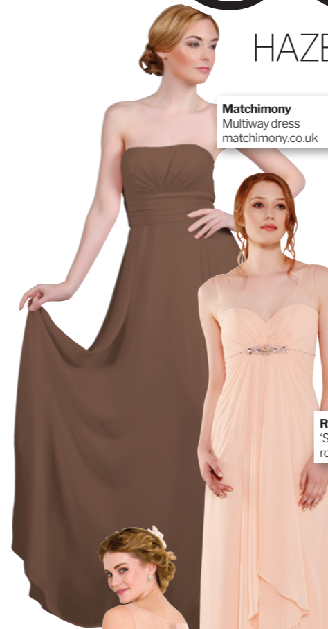
Matchimony Multiway dress matchimony.co.uk