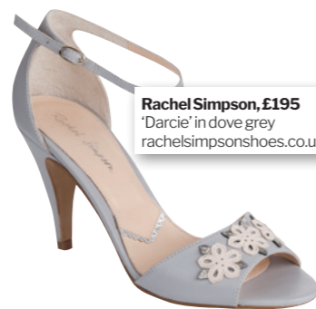
Rachel Simpson, £195 'Darcie' in dove grey rachelsimpsonshoes.co.uk